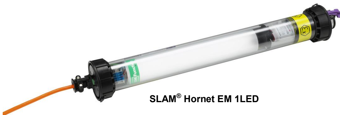
SLAM® Hornet EM 1LED

Thank you for choosing SLAM® Hornet –portable work light with battery back up for your job site. Purpose of this manual is to provide you all the necessary safety and product information to conduct your job conveniently and without any risks for health and safety.