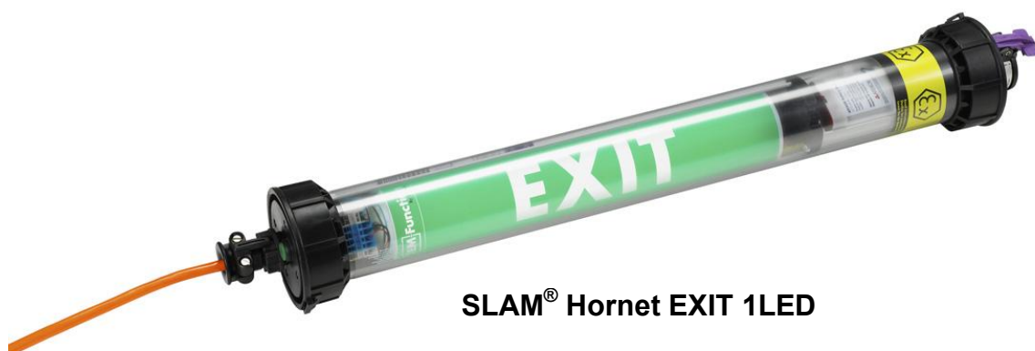
SLAM® Hornet EXIT 1LED